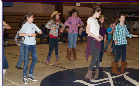
(Pictured above) Students kicked up their heels to line dance at the Hoedown on Friday.